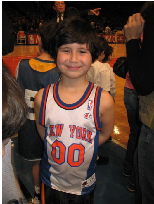
Me at a New York Knicks basketball game, about 7 years old

winter and just as many baseball games each summer. I fondly remember one summer evening, when my dad told my brother and I that we had to go shopping with him, and as we begrudgingly walked to the train station, he pulled out our baseball gloves and hats from his bag, and told us we were going to go see the Mets play the Reds—my favorite team against my brother’s. Everything paled in comparison to seeing a game live; there was something about the atmosphere of the stadium, beyond the lure of greasy ballpark food.