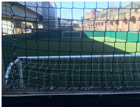
A panorama of “Powerleague Shoreditch” and a view of one of the fields

This immense space and others like it show the London community’s clear love for playing sports, regardless of the level, and these parks and fields function as spaces in which people can connect with one another, fulfill their passion for playing sports and feel as included and as central to their team as I did all those years ago back in Little League, standing at third base.