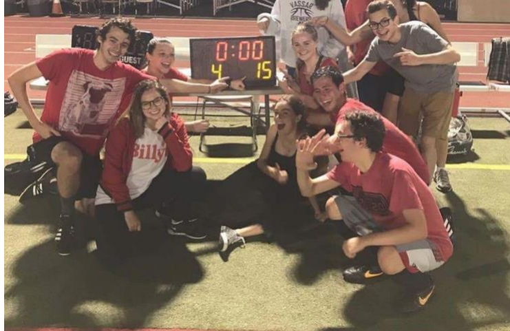
My friends and I after an intramural game of soccer at Vassar

This feeling of pure love of playing the game is clearly visible in London as well. Although I haven't sought out playing sports in London to the same extent as I have back home due to a bad knee, I see sports being played all over the city, every day, whether it be hearing the children in the playground outside my window shrieking in delight all morning as they play basketball and soccer, or watching pick-up games form in courtyards and parks. When it's a nice day, my friends and I often go to the green on campus and join in the large groups of people passing around soccer balls and frisbees, just as I do with my friends back home. Just like in America, playing sports builds a community, one that when in the hands of the right people, is an inclusive group that plays out of passion and joy, not just pure competitiveness.