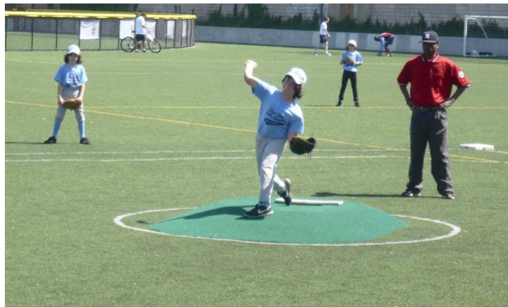
Me batting and pitching in a little league baseball game, around 10 years old.

I remember this moment fondly, not because it was such an extraordinary play by any standard; by the time players get to high school, they're expected to make that play every time. It means a lot to me because I didn't have many plays like that as a kid. I wasn't the most athletic kid, I wasn't fast, and I wasn't particularly strong, but I loved to play sports, maybe more than anything. My love for playing sports extends as far back as I can remember. Although my elementary school was not even 100 yards away from my house, I would have my dad bring a football on the walk over every day, so that we could play catch for maybe two minutes. And after school let out each day, I would go to the playgrounds and fields of Central