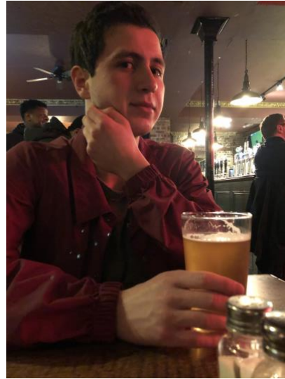
At the Rose Pub, watching a rugby match

The big difference I noticed between the bar and the pub, however, was that the pubs were significantly more family friendly than any bar in America. On a Saturday evening, the Rose Pub was filled with just as many tipsy young adults watching the game as it was with strollers, young children, and tables littered with crayons. I found this quite interesting, as a child at a bar in America would seem incredibly out of place, regardless of whether or not they were accompanied. In Britain, however, especially before late at night, the pubs are a communal space, where families with young children as well as young adults grabbing a drink with friends alike can relax and enjoy a game. Although at first it seemed rather funny to me, I realized I was jealous that I didn't have access to a more communal space to watch games when I was younger, as it was far more engaging and exciting than simply watching it on the couch at home.