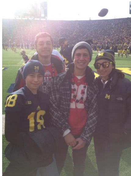
My brother, my cousins, and I at the Ohio State vs. Michigan game, age 17

Every other Thanksgiving, my cousins in Michigan host my family, for what is always, without fail, my favorite weekend of the year. The endless amounts of delicious food and wine, combined with spending time with family that double as some of my closest friends would already be enough on its own, however the highlight of the trip every year, without fail is the Ohio State vs. Michigan college football game.