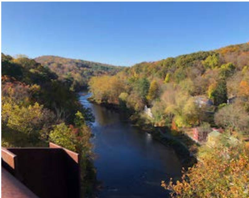
Gentle Walks Visits Rosendale and the Women's Studio Workshop 14